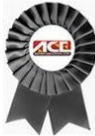
ACE Silver Care

Call Today for a FREE Site Survey & Quotation!